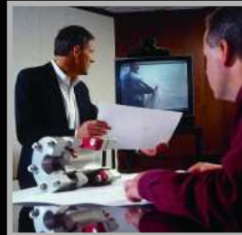
Taper-Lok® High Pressure Closure